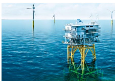
LEFT Structural analysis of offshore platform with ROSAP.